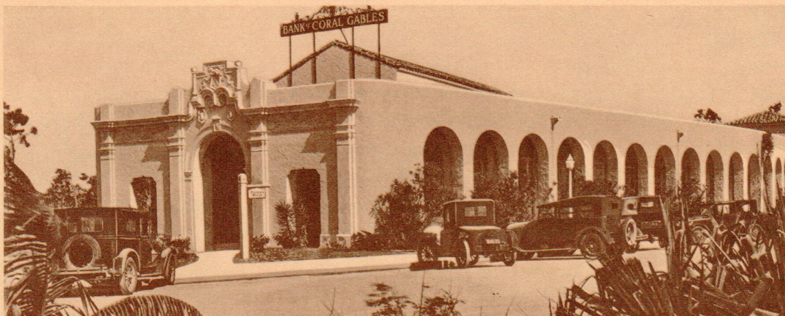
THE BANK OF CORAL GABLES

down, George E. Merrick, having abandoned his training and education in law and literature in the North, set before himself the ideal of building a model city wherein nothing should be unlovely. In November of 1921, his original holdings having been expanded gradually to 3,000 acres, the project of his life was launched. So greatly did it succeed, that on April 29, 1925, Coral Gables was incorporated through the legislature of Florida, as a city in its own right. Today, the assessed valuation of its taxable property is $92,250,312, with a rate of only 13½ mills on fifty per cent of the fair market value of land unimproved, improvements not being taxed.