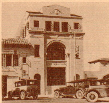
FIRST NATIONAL BANK

Cultural, religious and community progress has kept pace with material enhancement of property values pushed forward by construction and development programs of great magnitude. In addition to its complete school system, there are eight religious congregations in Coral Gables, organized by the major denominations. Coral Gables Congregational