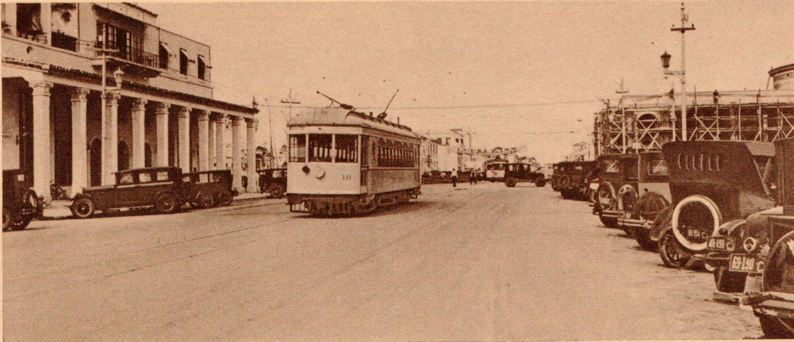
TYPICAL STREET SCENE IN CORAL GABLES