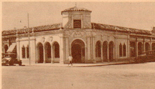
TYPICAL BUSINESS BUILDING

Coral Gables is in truth a city beautiful, and substantial withal. Its homes are set in